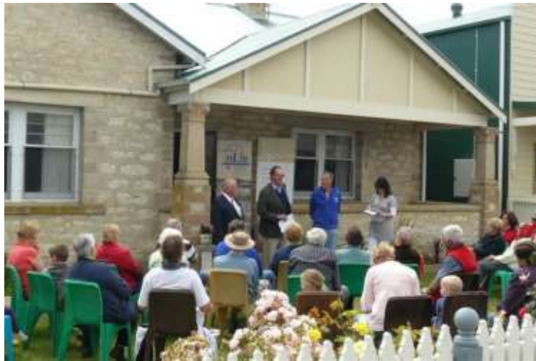
Launch of Meningie Lakes Hub, November 2010

In November 2010, a second Community Hub was launched in Meningie to provide the Lake Albert community with access to information about CLLMM Program projects underway around Lake Albert and the Coorong, as well as to encourage community involvement in local projects.