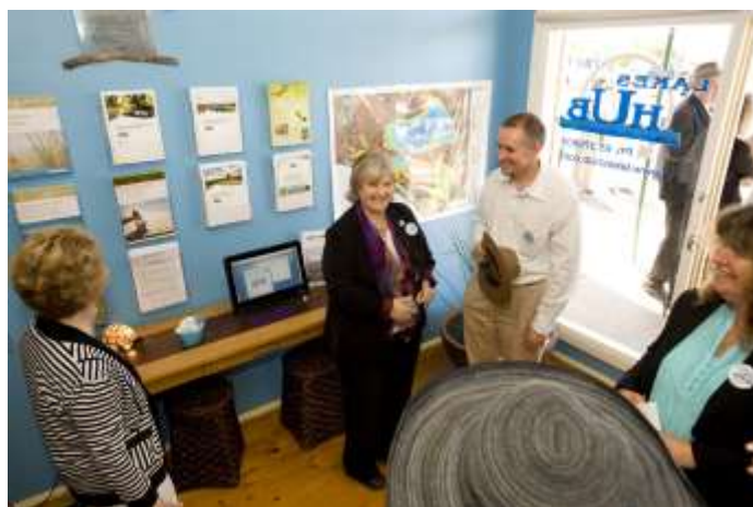
Minister Jay Weatherill at the launch of the Milang Lakes Hub, December 2009

The Milang Hub was launched by Minister Jay Weatherill, Minister of Environment and Conservation in December 2009.