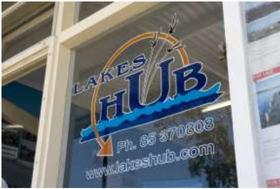
Shop-front of Milang Lakes Hub